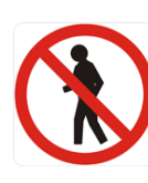
No pedestrians sign