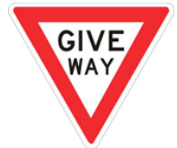
Give way sign

Regulatory signs also include parking zone signs, which let you know where you are allowed to park or stop.